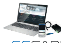
SECARD SECard configuration kit and SSCP® v1 & v2 and OSDP™ protocols