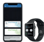
Bluetooth® & NFC smartphones / smartwatches using STid Mobile ID® application